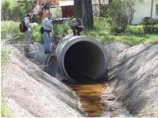
#1 – Draining the Land