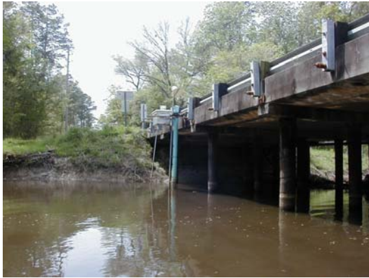
#9 – Monitoring the Water