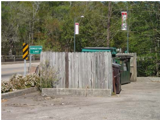
#11 – Direct Dumpster Drainage