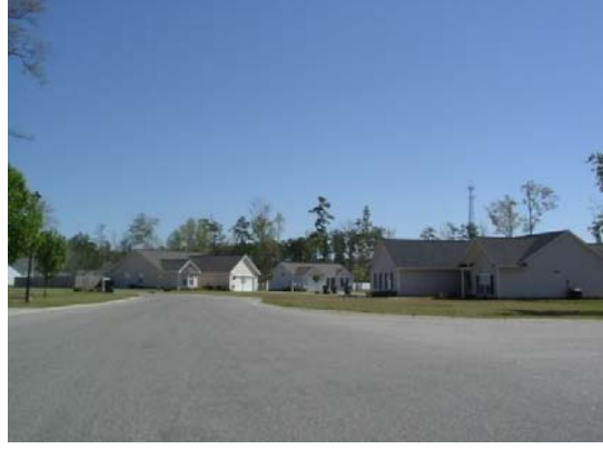
#6 – Plenty of Pavement