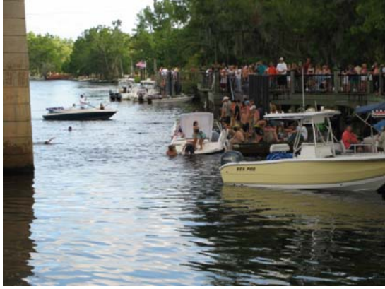
#13 – People Use the Water