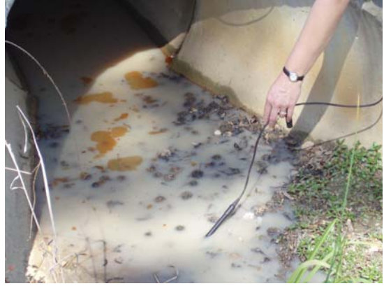
#2 - Illicit Discharge Detection