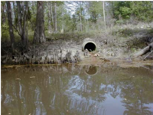
#7 – Pipes from the Wilderness?