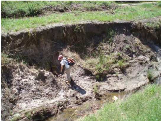
#3 – Bank Erosion