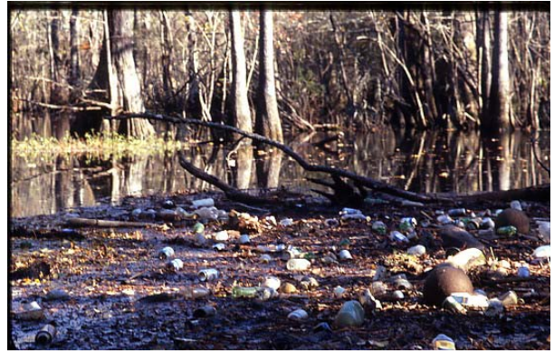
#10 – Piles of Trash