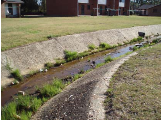
#5 – No Buffers